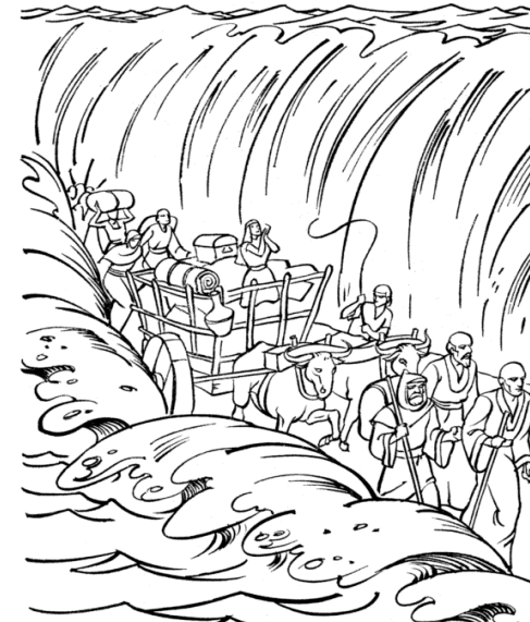
The waves parted and the Hebrews crossed safely.

Walls believed side children sea escape Egyptians wheels sing fear staff knew danced Moses goodness